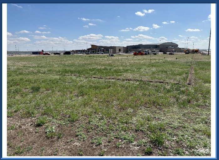
Cottonwood & Chestnut St, Julesburg